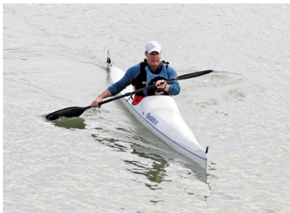
Miles—the one to beat!

Handicaps will be electronically generated, based on previous times. At the end of each race points are awarded according to place.