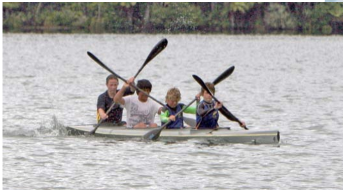
Under 15 Men How NOT to paddle a K4!